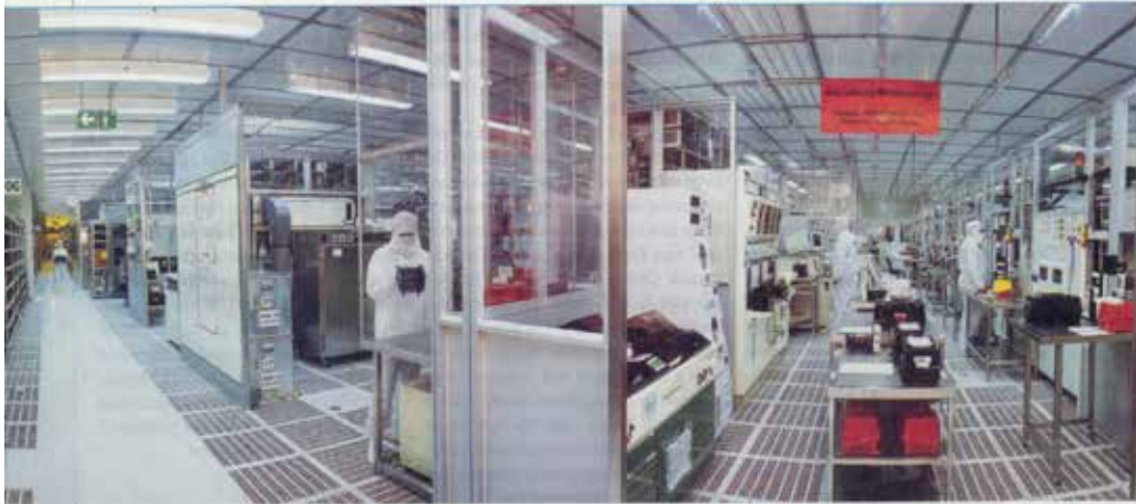
Figure 2 A Radically Different Manufacturing Facility for Producing MEMS Products

suits, as shown in Figure 2. The concept of involving “process” in place of “machine tools” is an important fact in the minds of microsystems engineers.